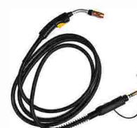
Mig Torch (NQ400-EURO)