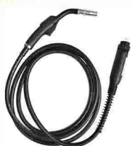
Mig Torch (PSF405-5)