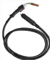
Mig Torch (NT4-15E)