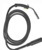
Mig Torch (N40-5)